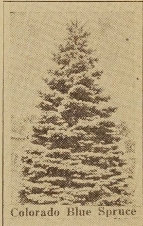
Colorado Blue Spruce

Several years ago this tree was used only as an ornamental. However, its extreme hardiness, rapid rate of growth and broad, dense branches extending to the ground are ideal characteristics of a shelter belt tree. As the use of the Blue Spruce became more general the cost of young trees has been reduced each season and prices now are such that every grove can be fortified with a row of these beautiful, drouth resistant trees. Usually there are about 10 good blue specimen trees to every 100. We do not make a practice of "holding out" these select specimens, thus enabling you to select a few very beautiful specimens for planting about the house or lawn. Be sure to plant at least a few Colorado Blue Spruce this year, they more than double in value each season and are the easiest evergreen to grow.